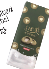
Kubomi 1,080 yen