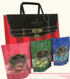
kokyu chocolate 2,100 yen