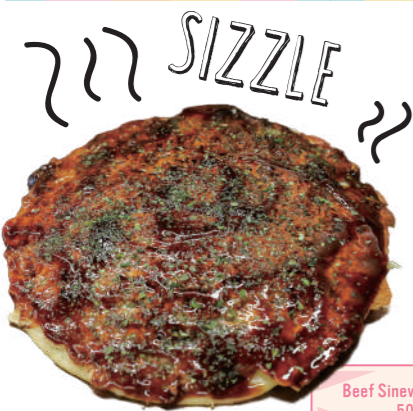
Beef Sinew Okonomiyaki 500 yen