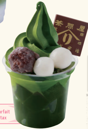
Thick tea parfait 980 yen + tax