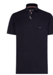
REGULAR POLO 9,400 yen