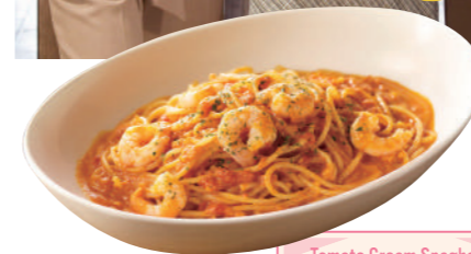
Tomato Cream Spaghetti with Shrimp 840 yen + tax

利用換登機牌之前的時間 체크인 대기 시간에. While waiting for check in.