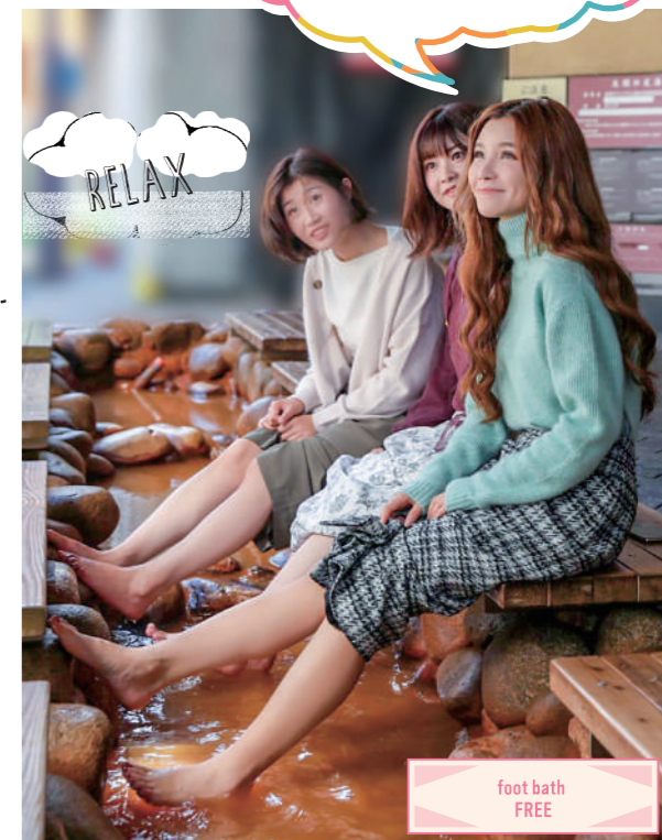
foot bath FREE