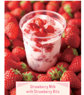
Strawberry Milk with Strawberry Bits 490 yen + tax