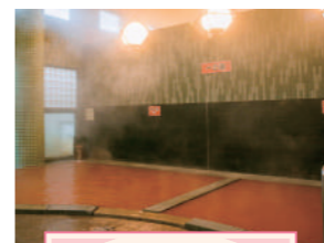
Adult(Junior high and above) 650 yen Child(elementary school) 340 yen