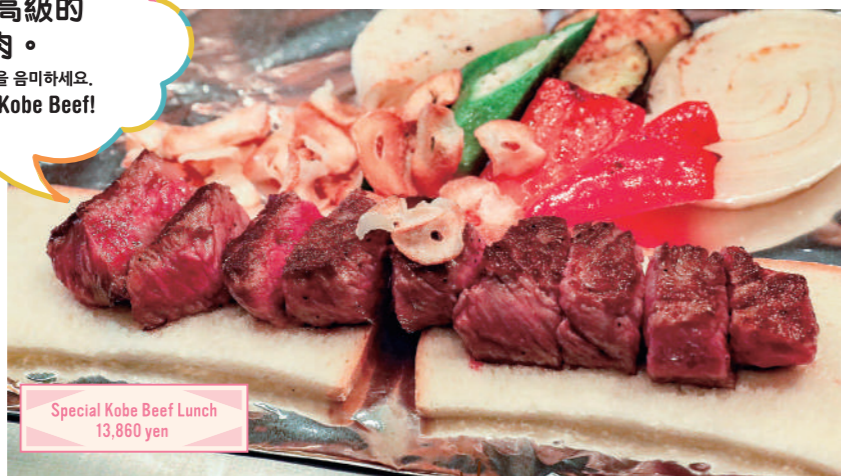
Special Kobe Beef Lunch 13,860 yen

品嚐到了最高級的 神戸牛肉。 최상급 고베 소고기의 맛을 음미하세요. The world famous Kobe Beef!