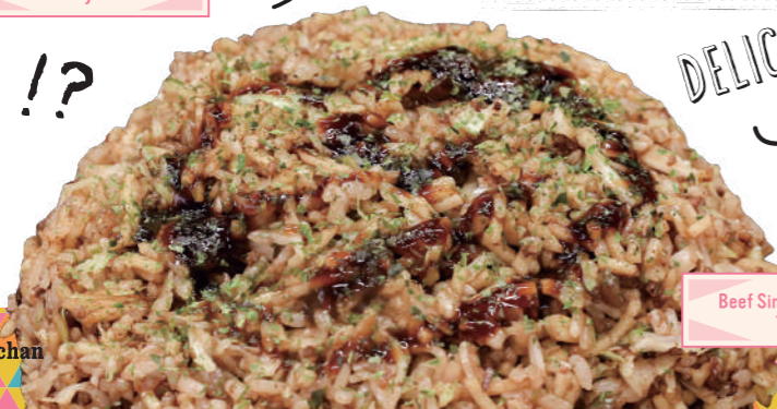
Beef Sinew Soba-Meshi 750 yen