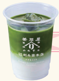
Matcha Latte ICE(M) 680 yen + tax

쇼핑 중 잠깐의 휴식♥ A little break in between shopping.