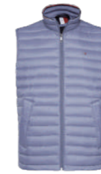
PACKABLE DOWN VEST 19,600 yen