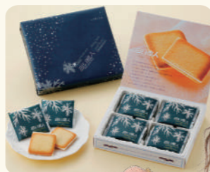
Shiroi Koibito 740 yen