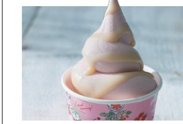
Strawberry milk softcream 540 yen

06-6631-1101 10:00-20:00 *Open until 8:30 p.m. on Fridays and Saturdays.