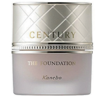
TWANY CENTURY THE FOUNDATION n 21,600 yen