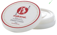
Natural Perfection Hand Cream 1512 yen