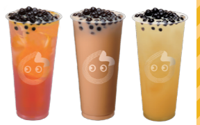
Passion Fruit Black Tea with Pearl M 475 yen L 585 yen Pearl Milk Tea M 485 yen L 595 yen Mango Yogurt with Pearl M 585 yen