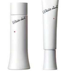
White Shot LX 11,880 yen White Shot MX 11,880 yen