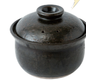
Black glazed Clay pot(200g) 9,612 yen