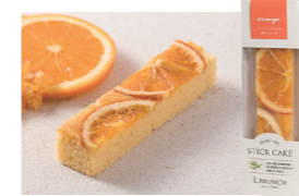
Stick Cake Orange 292 yen