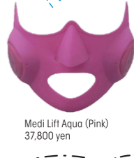
Medi Lift Aqua (Pink) 37,800 yen