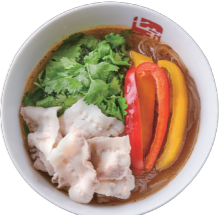
Spicy Hot Pot 770 yen ~