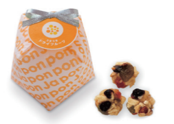
pon pon coco dried fruits 454 yen