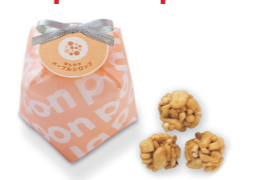
pon pon coco maple syrup 454 yen