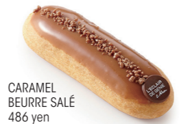
CARAMEL BEURRE SALÉ 486 yen