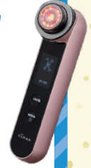
Photo PLUS EX eye pro 54,000 yen