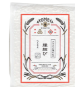
"En-musubi" (quantity: 450 g) 670 yen

AKOMEYA TOKYO offers many types of rice grains from all over Japan. The current recommendation is 'En-musubi', meaning 'love-knot'. This special rice has the perfect balance of firmness in texture and moisture for spiciness. Delicious even when served cold! Definitely a great gift to your loved one.