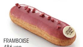
FRAMBOISE 486 yen