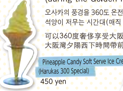
Pineapple Candy Soft Serve Ice Cream (Harukas 300 Special) 450 yen

1-1-43 Abenosuji, Abeno-ku, Osaka 06-6621-0300 9:00am-10:00pm / Operating hours are subject to change without prior notice. Same-day tickets are on sale from 8:50 to 21:30. Open All Year ¥ Same-day Ticket / Adult (age 18 and over) 1,500yen