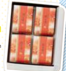
Suikanshuku Persimmon Treats Pack of 4 2,484 yen

유서 깊은 화과자 전문점. 제철 과일을 사용한 상품이 인기! 日式糕點屋的老店舖。使用季節性水果的高人氣商品。