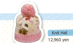
Knit Hat 12,960 yen