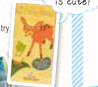
Forest Butter Cake 972 yen Pack of 4