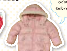
Down Jacket 54,000 yen~