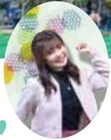
Loves food Iku chan

利用文章或動畫等傳送日本最新資訊的居住日本的中國人部落客。並且出現在眾多日本媒體中，是現今最受矚目的影響力者。